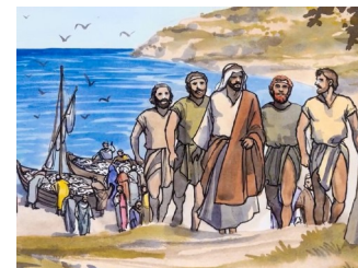
(calling the first disciples)

If you require offering envelopes for 2022, you can pick them up from the back table in the hall. For members of the Congregation who pay either by direct debit or 'E give', can you please not take envelopes. Just pick up and put in the offering bag the small cards which are in the small baskets on the tables as you come in the Church or the Hall. Thank you, much appreciated.