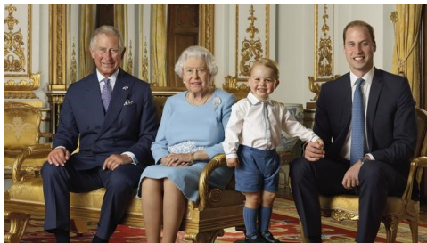
The Royal Line