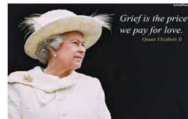
Grief is the price we pay for love. Queen Elizabeth II