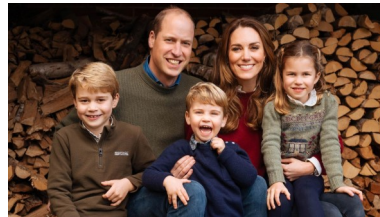
My Grandchildren and My Great Grandchildren