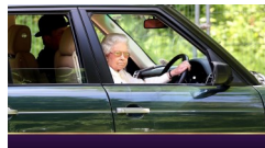
Road rage? Surely not!