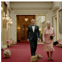
Do be careful of my corgis, Mr Bond,