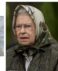
Scarves are the height of fashion.