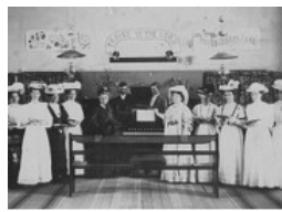
Church Choir (right)