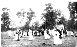
Church Picnic (left)

As we celebrate our 157th birthday, we also acknowledge that the land on which this church is built is the traditional land of the Kurna people, and we respect their spiritual relationship with their country.